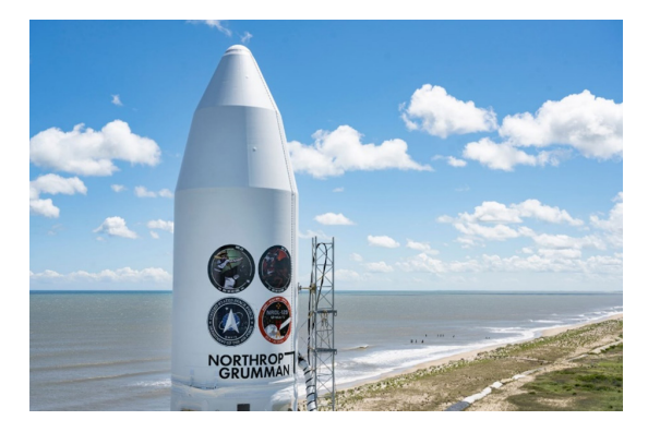
NROL-129 launches out of NASA's Wallops Flight Facility, Virginia, on July 15, 2020.

collaborated with Rocket Lab to launch the "Don't Stop Me Now" mission, carrying three payloads designed, built, and operated by NRO, also procured under the RASR contract.